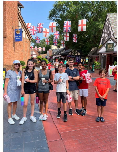
Busch Gardens Day