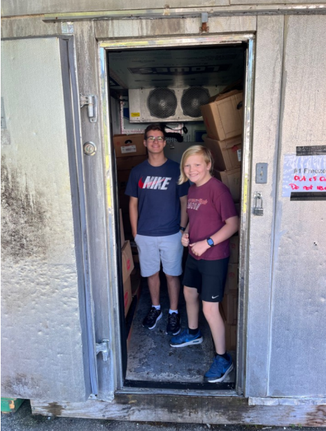
Belmont Food Pantry Support moving frozen goods on a hot day!