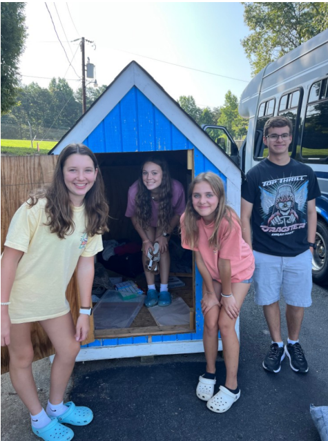
Sunday Nights at 6:00! Plenty of other small groups, devotions and service opportunities to plug in as well.