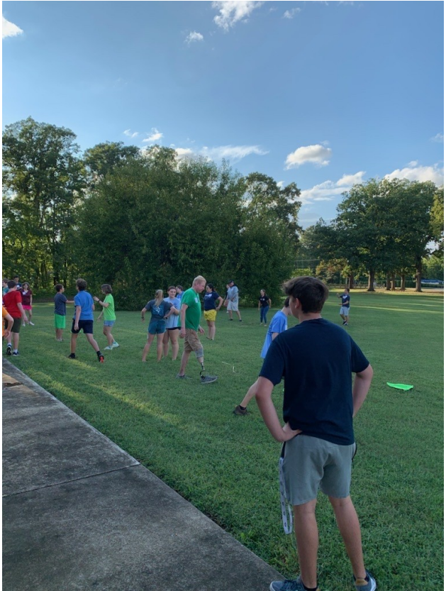
Water Balloons at West End Circuit