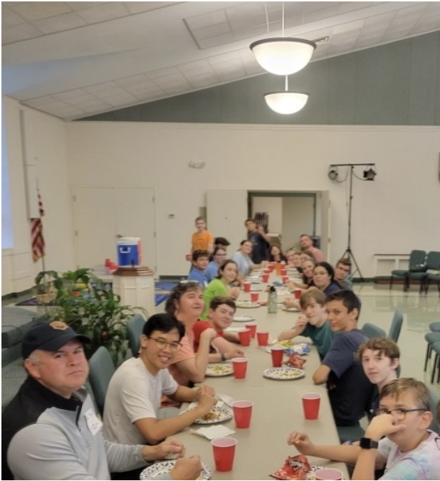
A great dinner with friends

Youth Night of Worship on Oct 8th at Discovery UMC! River Road Youth plan to go, along with a number of other churches in the area. All youth are welcome! Details on back of the newsletter.