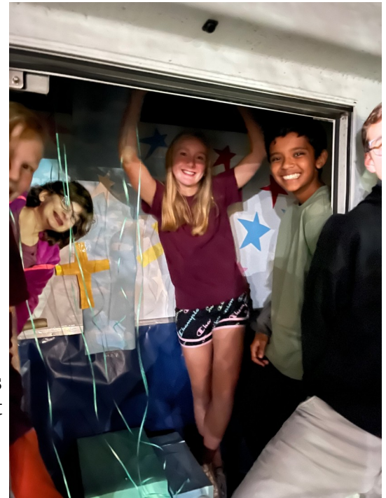
Decorating the bus for Fall Fest