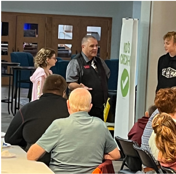
Magic time with the West End Circuit

Youth group every Sunday at 6:00! Other outings and small group time as well. Sign up with youth@riverroadumc.org .