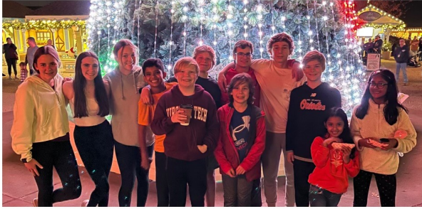
Decorating for Christmas!

Youth are great! In 2024, we will start a study of Luke and continue to meet for Youth Group on Sunday evening. We also have small groups meeting for Sunday School, evening bible study or morning breakfast at Chick-Fil-a! All 6-12th graders are welcome anytime.