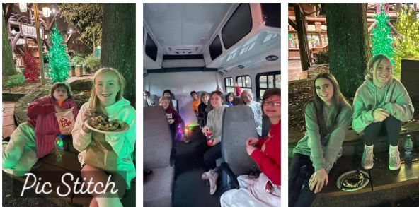
Youth Night out at Busch Gardens